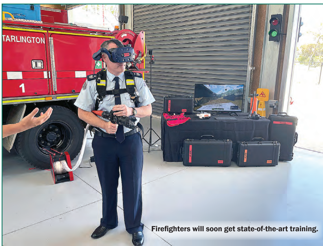
Firefighters will soon get state-of-the-art training.

The FLAIM Trainer and FLAIM Extinguisher are unique training systems developed specifically for