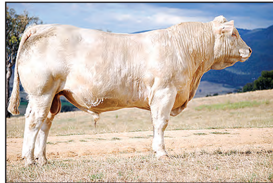
A draft of above average bulls is available at Challambi Charolais.

Challambi Charolais is located at 512 Welumba Creek Road, Greg Greg - 25kms north of Corryong towards Tumbarumba. Further information is available on the website www.challambicharolais.com.au or Facebook page @challambicharolais.