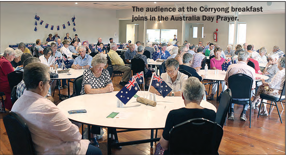
The audience at the Corryong breakfast joins in the Australia Day Prayer.