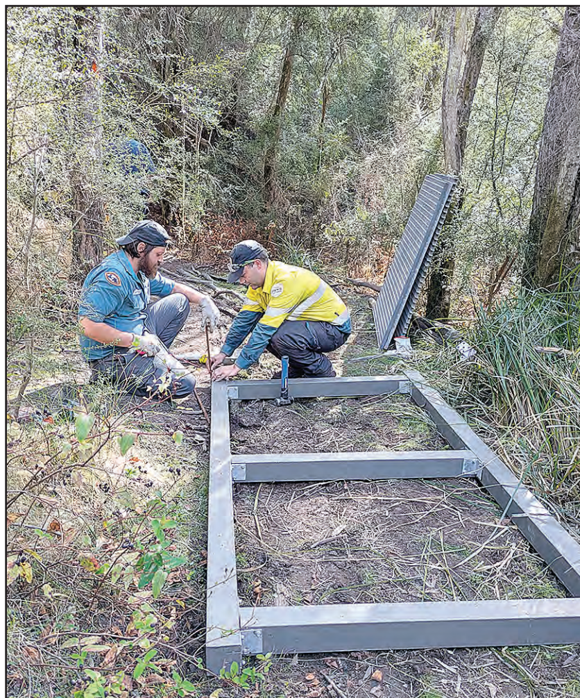
Rangers can undertake a variety of projects to protect our parks.

"Our rangers are so important to Victoria - whether it's in one of our urban parks, a marine sanctuary, a campground or a wilderness area - everyone benefits from the