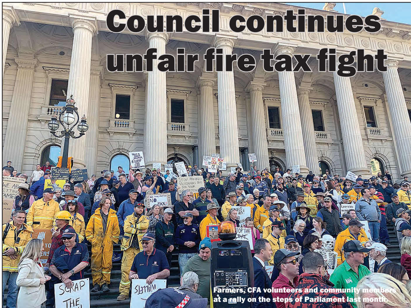
Farmers, CFA volunteers and community members at a rally on the steps of Parliament last month.

Opening hours:- Monday to Friday 5.30am - 5.00pm / Saturday 5.30am - 1.00pm / Sunday 7.30am - 12 noon / Public holidays 5.30am - 12 noon.