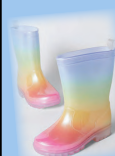
Table of Footwear $20 a pair