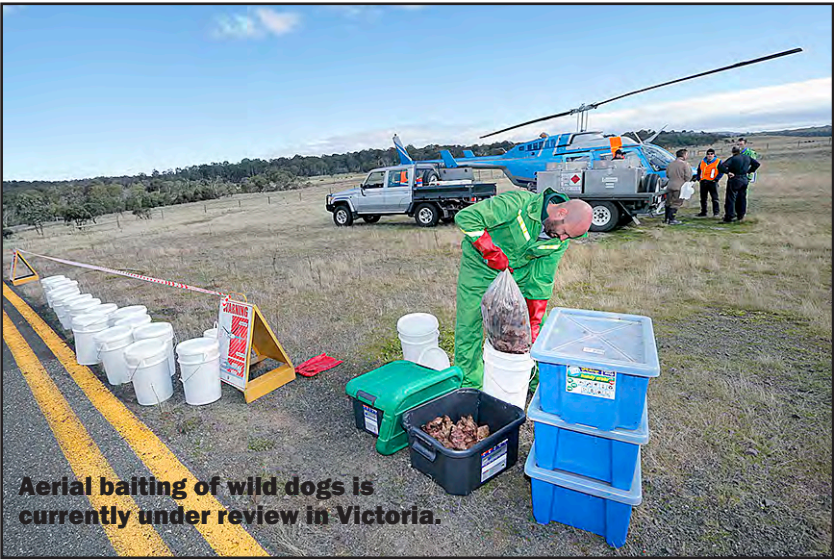
Aerial baiting of wild dogs is currently under review in Victoria.