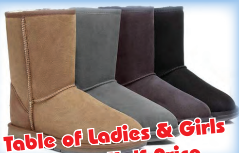
Table of Ladies & Girls Boots - Half Price