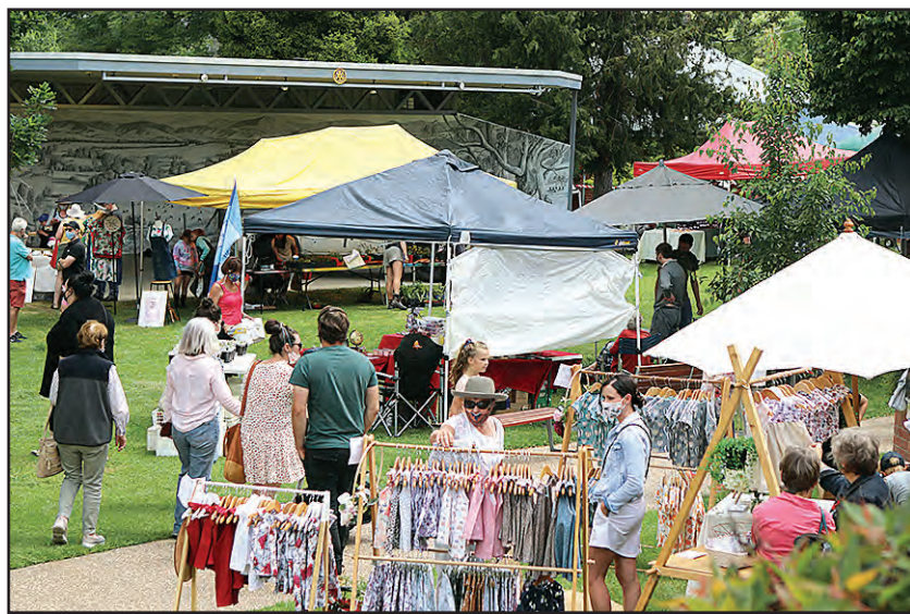
The first market of the season was well patronised

Watch the Courier for more information about the next market.